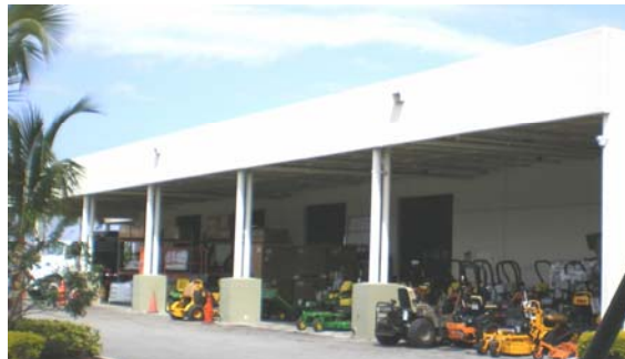
Staging area for inventory sales / service