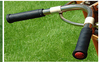
Senso-Grip Operator Presence System

The new Senso-Grip operator Presence System detects the touch of the operator without using paddles, switches or buttons. This increases hand comfort and combined with the "no squeezing" V-Bar Drive System makes this operation an all new way to walk.